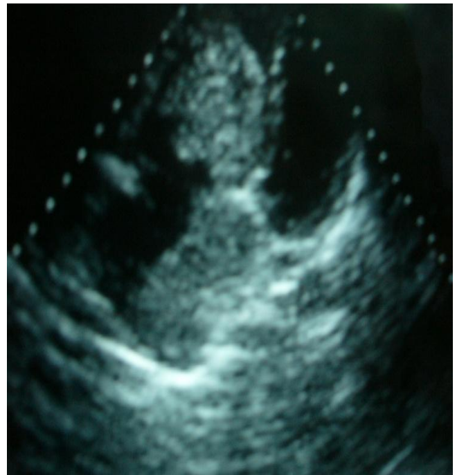
Figure 3. Echocardiogram demonstrates an atrial mass of size 4.57 x 4.41 cm in the right atrium with mild tricuspid regurgitation