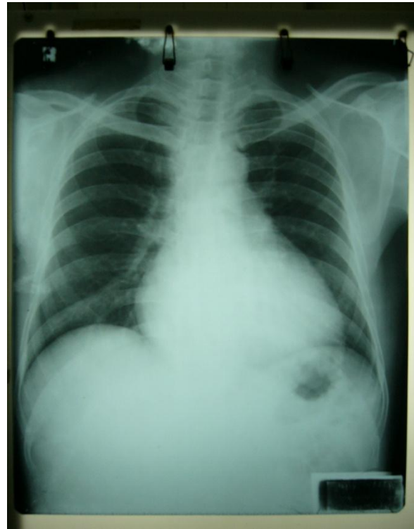
Figure 2. Cardiomegaly without features of heart failure

Transthoracic echocardiogram showed normal mitral valve with ejection fraction of 0.56. There was an echogenic atrial mass of size 4.57 x 4.41 cm in the right atrium, some portion of which prolapsing through and across the tricuspid valve along with mild tricuspid regurgitation (Figure3).