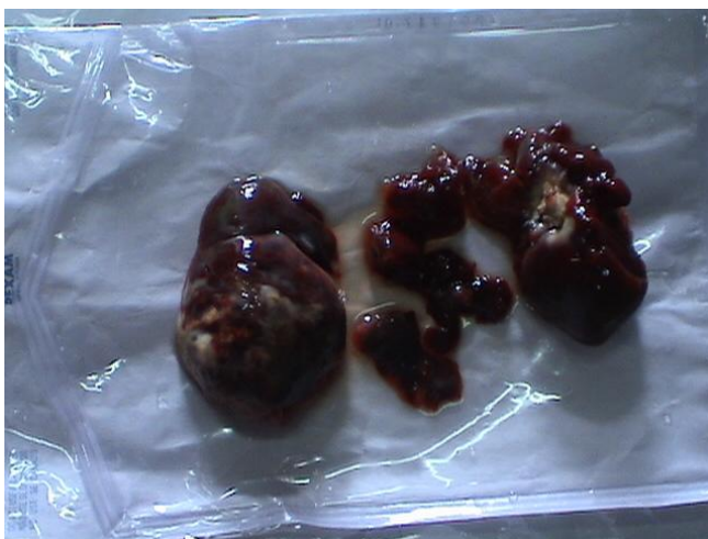
Figure 5. Gelatinous lobulated right atrial myxoma with irregular surface and pieces of loose friable tissue after surgical excision (Main tumour mass with broken pieces due to friability of myxomatous tissue)

Due to the friable nature of myxoma tissue, the tumour was broken into various pieces after surgical excision (Figure 5).